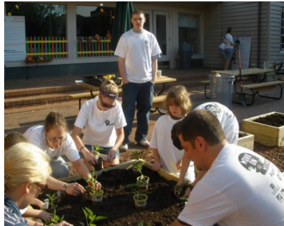
Changing the look!

The team, after working hard for numerous hours, left behind an updated environment for the community children and those visiting to enjoy for years to come. Anyone can read more about this worthwhile project and learn