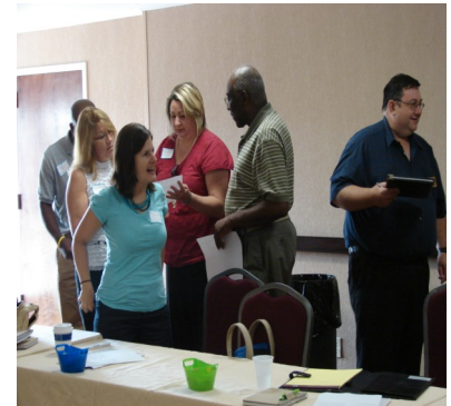
getting to know one another

tional forums. Topics presented and discussed included gaining administrative support, chapter building through Phi Theta Kappa programs, and PAM. Forums were specifically focused to address the advisor's role in chapter activities. Although this was not the first Advisor retreat hosted by the region, this was the first retreat in recent years. The alumni chapter is excited to have been able to fill this regional need, and we look forward to hosting another retreat in the future.